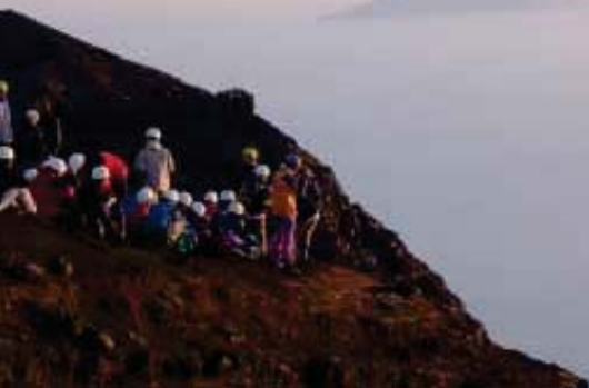
Stromboli Volcano - Sicily, Italy