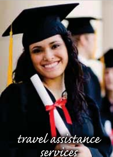
travel assistance services