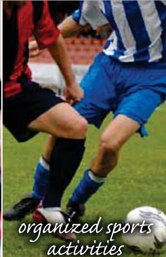
organized sports activities