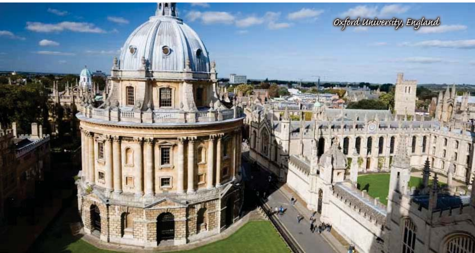
Oxford University, England

Benefit Period Medical Coverage - If you are hospitalized as Inpatient on your coverage Termination Date, StudentSecure® will provide a Benefit Period of 60 days for that condition only. The Benefit Period begins on the first date that you receive diagnosis or treatment for the condition and continues for 60 days, regardless of whether you are abroad or return to your Home Country.